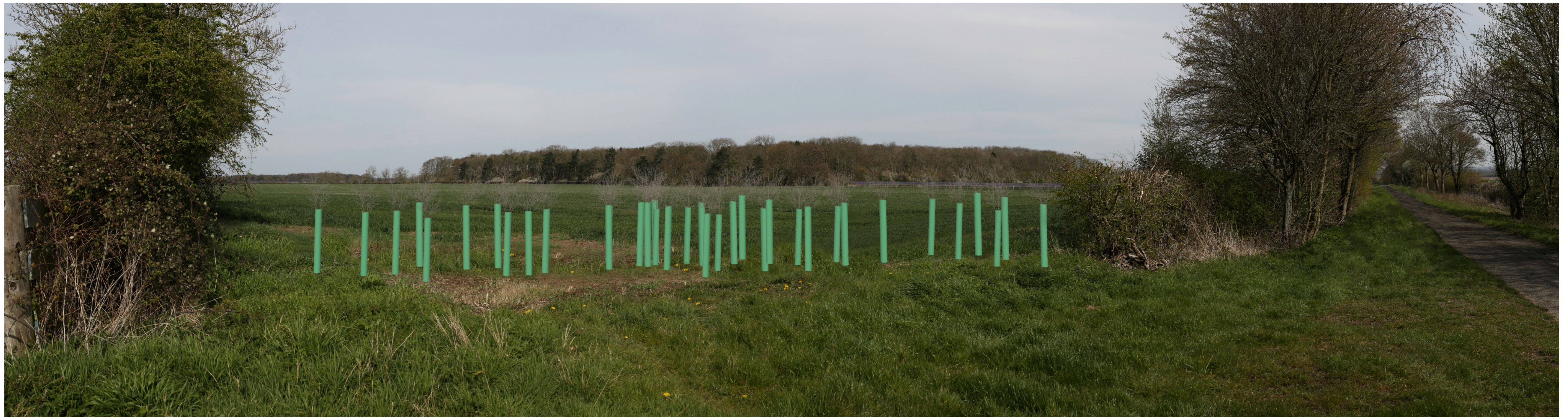
Proposed View Year 1 Distance to Nearest Order Limits 0m