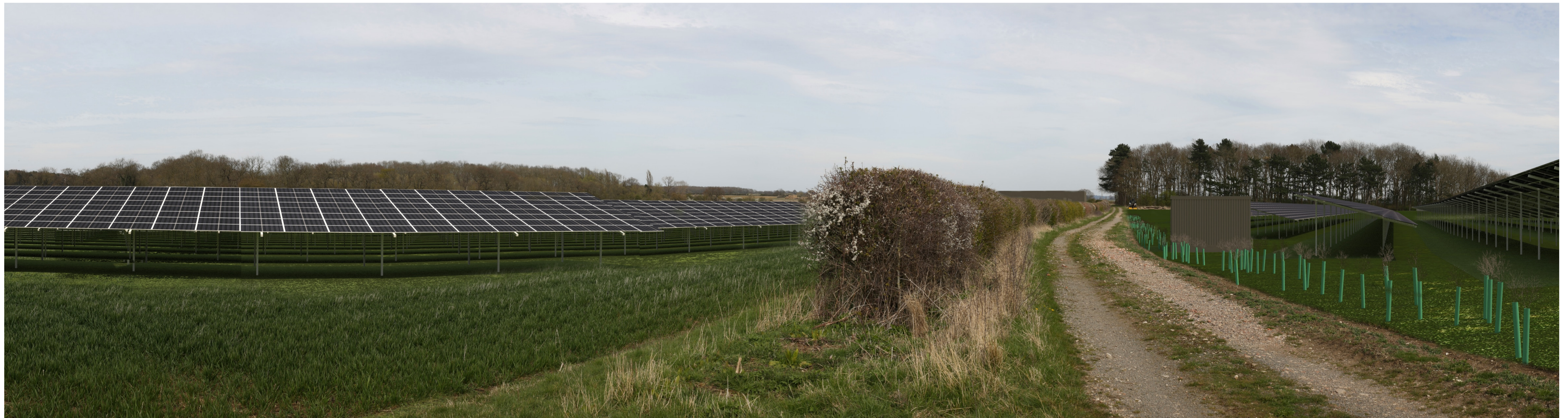
Proposed View Year 1 Distance to Nearest Order Limits 0m