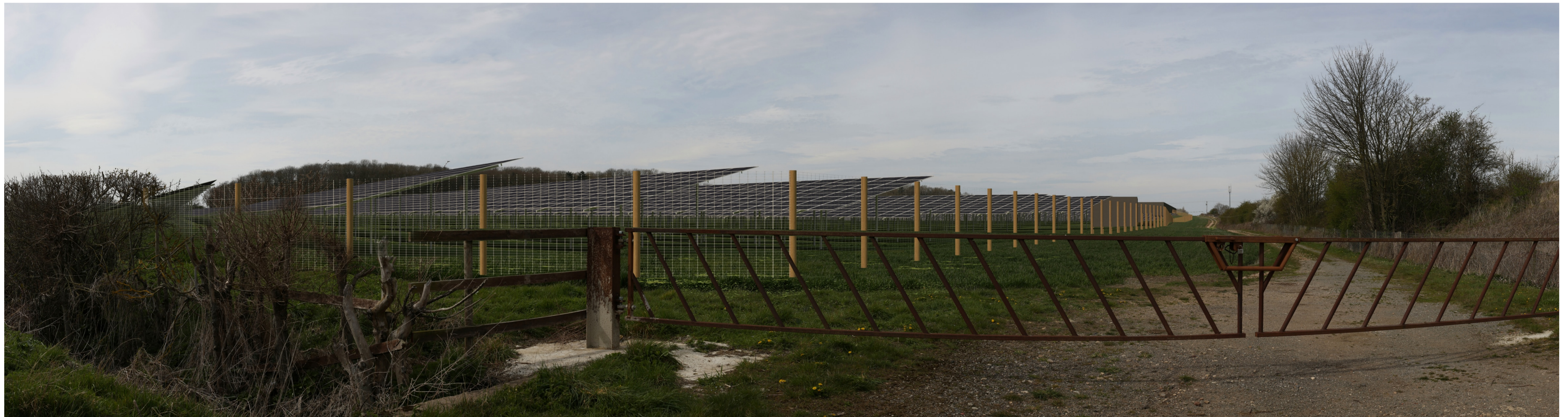
Proposed View Year 1 Distance to Nearest Order Limits 0m