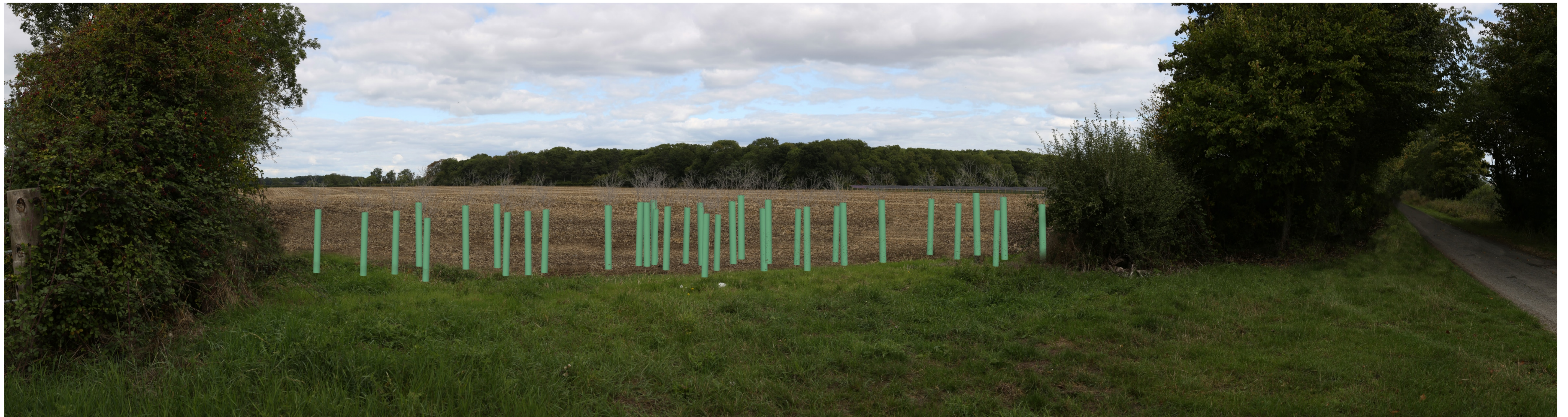
Proposed View Year 1 Distance to Nearest Order Limits 0m