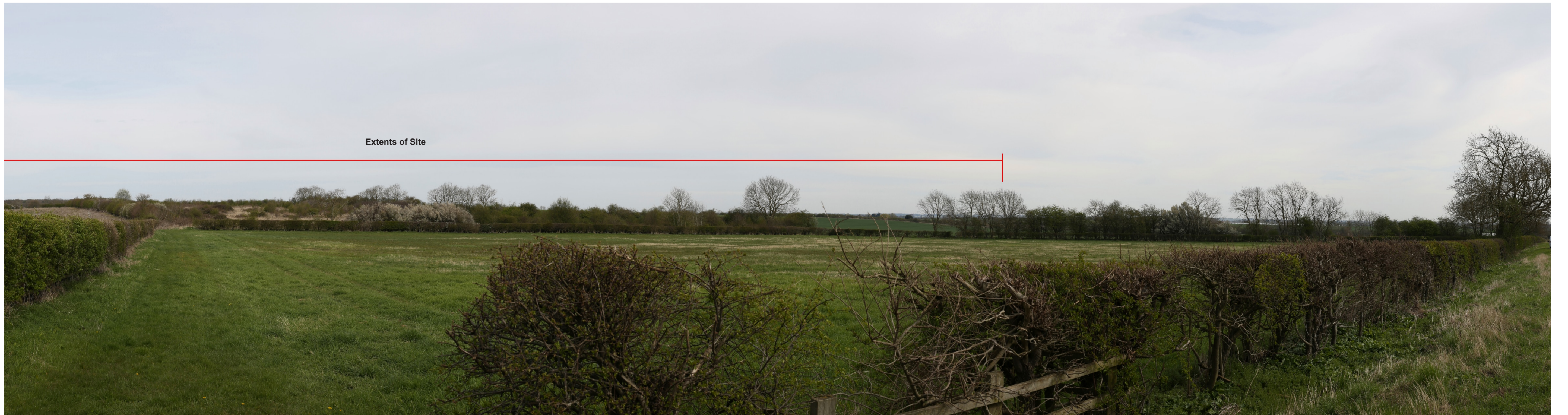
Proposed View Year 1 Distance to Nearest Order Limits 0m