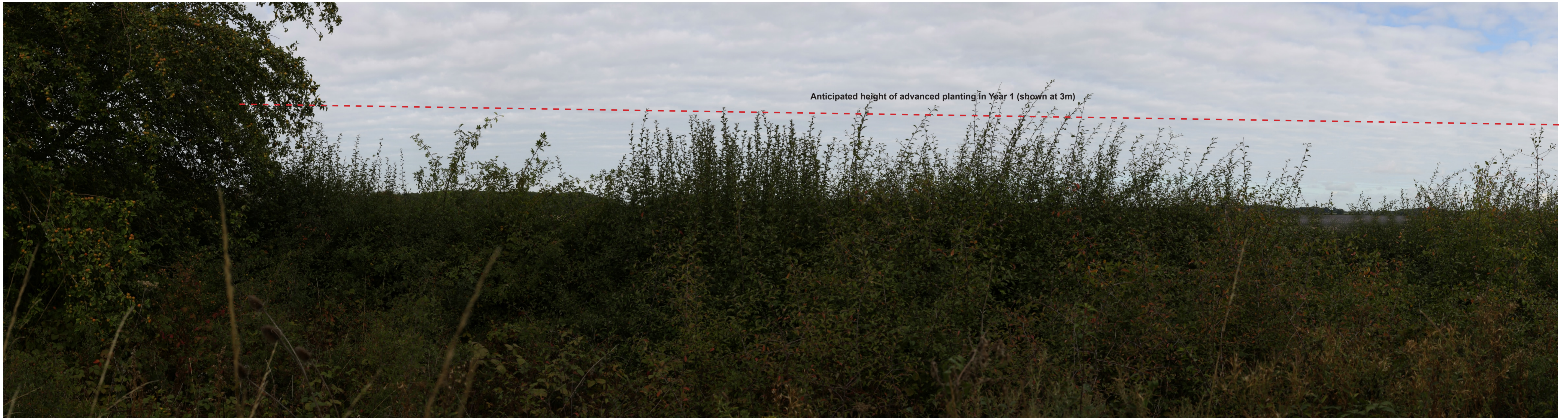
Proposed View Year 1 Distance to Nearest Order Limits 0m