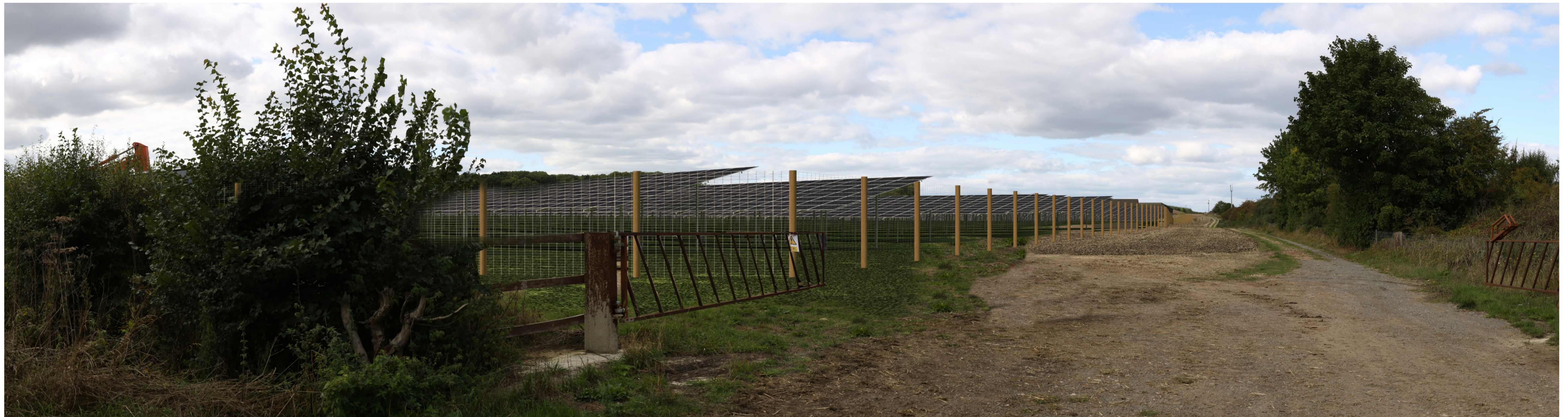
Proposed View Year 1 Distance to Nearest Order Limits 0m