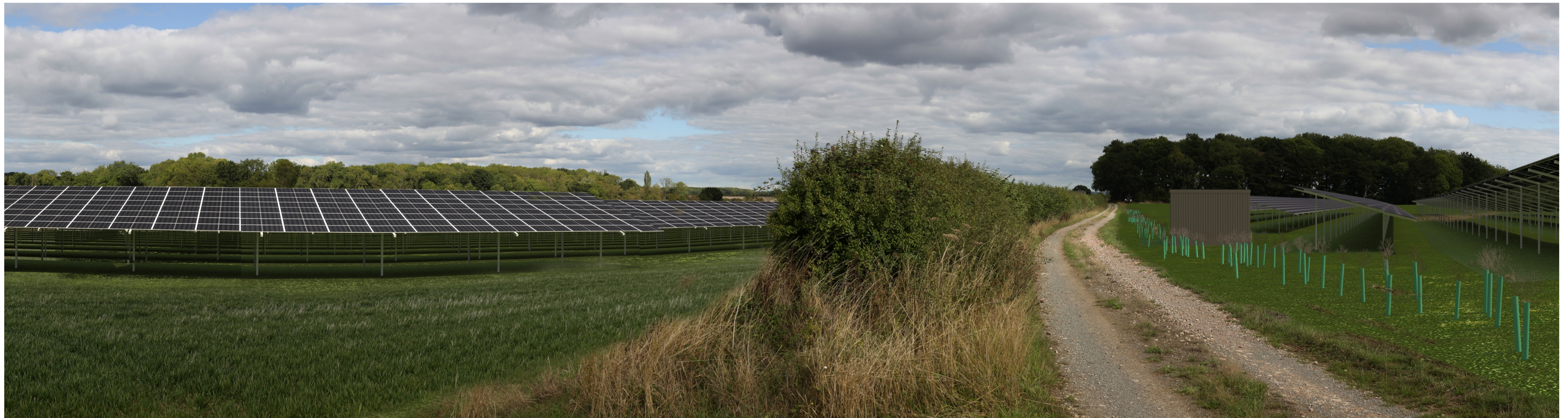
Proposed View Year 1 Distance to Nearest Order Limits 0m